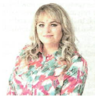
Senator Maria McCormack

The Department of Health has said that this model 'acknowledges that women are the most reliable narrators of their own symptoms and pain', and that the model will 'reduce delays in the management of symptoms' along with the overall impact of this disease on women. The care pathway aims to treat endometriosis cases by levels of severity; moderate cases will be